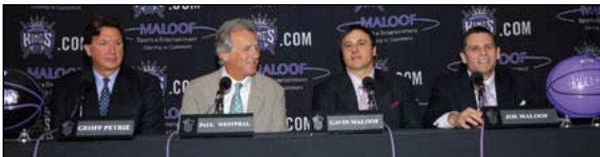
L TO R: GEOFF PETRIE, PAUL WESTPHAL, GAVIN MALOOF, AND JOE MALOOF